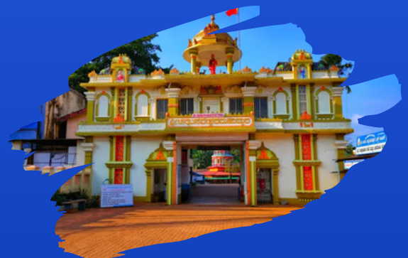
Ulavi Channabasaveshwar Temple